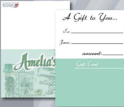
CARD HOLDER AND ENVELOPES

Promote Your Card Program with Customized Materials