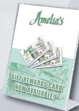
CUSTOM AND GENERIC COUNTER DISPLAYS