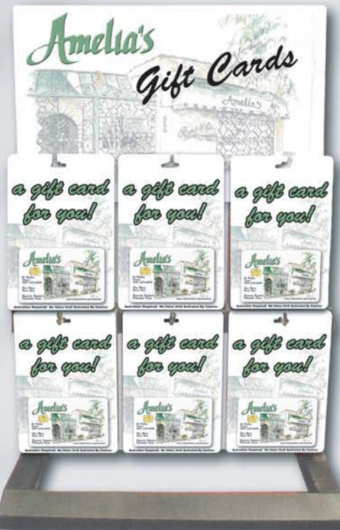
HANGING CARD DISPLAYS